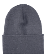
ATHLETIC OXFORD* No PMS