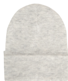
OATMEAL HEATHER*** Warm Grey 2C