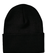
BLACK Black 6C

Textile fabric colours are subject to dye lot variation and will not be exact match to print Pantone reference