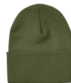
MILITARY GREEN 7771C