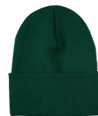
ATHLETIC GREEN 627C