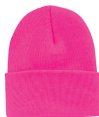
NEON PINK 806C