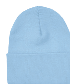
LIGHT BLUE 278C