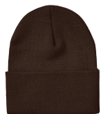
DARK CHOCOLATE 412C