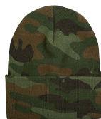
CAMO No PMS

*68/32 polyester/acrylic **54/46 polyester/acrylic ***53/47 acrylic/polyester