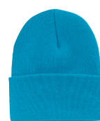
NEON BLUE 801C