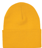
ATHLETIC GOLD 137C