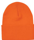
ORANGE No PMS