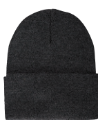
BLACK HEATHER** No PMS