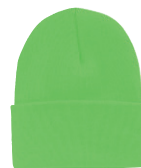
NEON LIME 802C