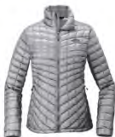
MID GREY Cool Grey 8C