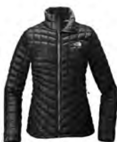
BLACK Black C

Textile fabric colours are subject to dye lot variation and will not be exact match to print pantone reference