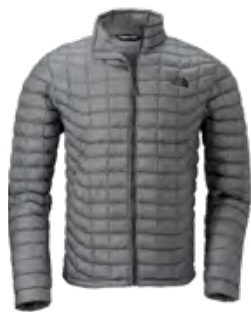
MID GREY Cool Grey 8C