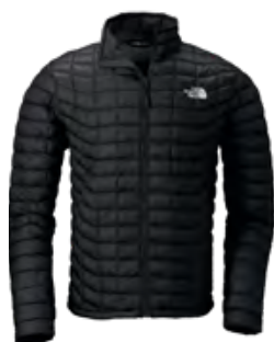
BLACK Black C

Textile fabric colours are subject to dye lot variation and will not be exact match to print pantone reference