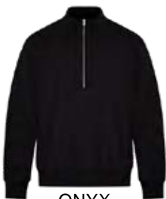
ONYX Black 6C

Textile fabric colours are subject to dye lot variation and will not be exact match to print Pantone reference