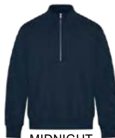
MIDNIGHT BLUE 4280C