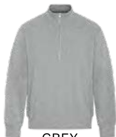
GREY HEATHER* Cool Grey 5C