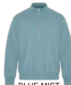
BLUE MIST 3526C