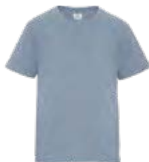
EARTH STONE BLUE 2157C