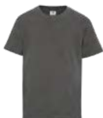
EARTH PEWTER Black 7C