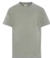
EARTH DOVE 416C