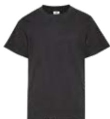
EARTH BLACK Black 6C

Textile fabric colours are subject to dye lot variation and will not be exact match to print Pantone reference