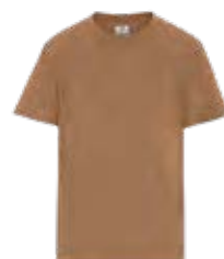
EARTH CARAMEL 7568C