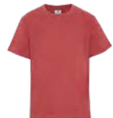
EARTH RED 202C