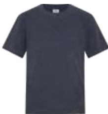
EARTH NAVY 2379C