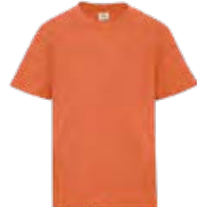
EARTH ORANGE 7579C