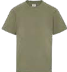
EARTH MILITARY 7770C