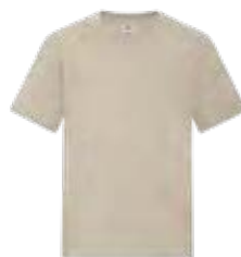
EARTH SAND 7527C