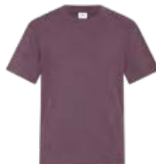
EARTH EGGPLANT 262C