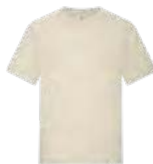
EARTH BONE 7534C