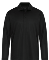
BLACK Black 6C

Textile fabric colours are subject to dye lot variation and will not be exact match to print Pantone reference