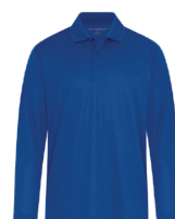
TRUE ROYAL 7686C