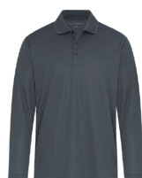
IRON GREY 7540C