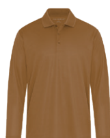
DUCK BROWN 7568C