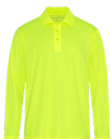
SAFETY YELLOW No PMS