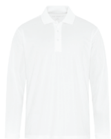
WHITE No PMS