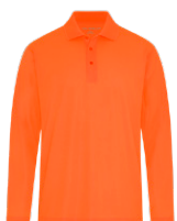
SAFETY ORANGE No PMS