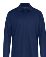
TRUE NAVY 539C