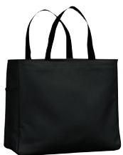
BLACK Black 6C

Textile fabric colours are subject to dye lot variation and will not be exact match to print Pantone reference.