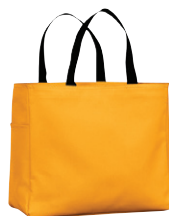
ATHLETIC GOLD 130C