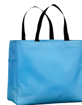
CAROLINA BLUE 7689C