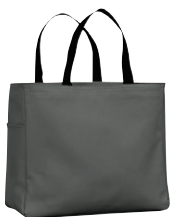
CHARCOAL Cool Grey 11C