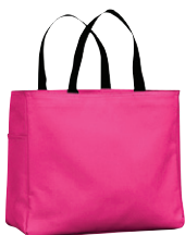
TROPICAL PINK 7424C