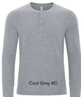
Cool Grey 6C