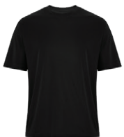
BLACK Black 6C

Textile fabric colours are subject to dye lot variation and will not be exact match to print pantone reference