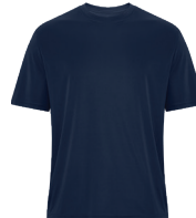
TRUE NAVY 539C