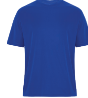
TRUE ROYAL 7686C