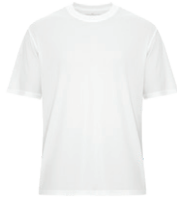
WHITE No PMS