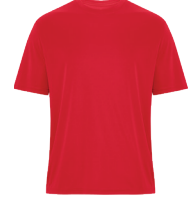
TRUE RED 200C