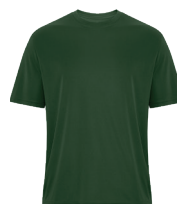
FOREST GREEN 7736C

Due to the nature of polyester, special care must be taken throughout the decoration process.