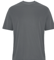
COAL GREY Cool Grey 10C