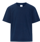
TRUE NAVY 282C