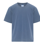
BLUE JEAN 2138C