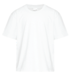
WHITE No PMS